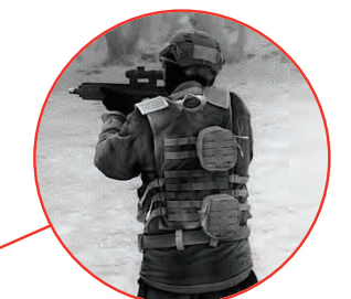
Trijicon Electro Optics 12µm, 640x480 @ 60Hz